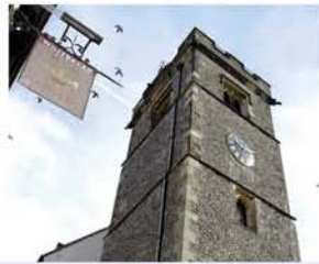
The Clock Tower Market Place St Albans Hertfordshire AL3 5DR