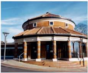
Verulamium Museum St Michaels St Albans Hertfordshire AL3 4SW