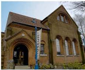
Museum of St Albans 9a Hatfield Road St Albans Hertfordshire AL1 3RR